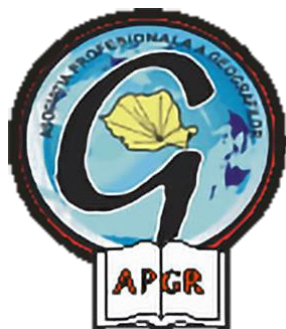
Professional Association of Romanian Geographers (APGR)