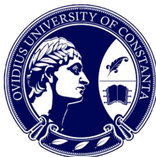
Ovidius University of Constanta