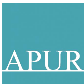
Professional Association of Romanian Urban Planners (APUR) – Constanta Branch