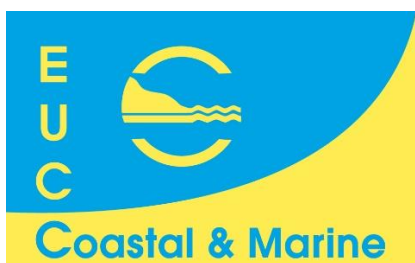
Coastal & Marine Union (EUCC)