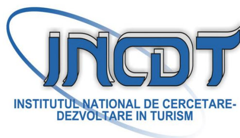
National Institute for Research and Development in Tourism (INCDT), Bucharest